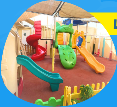
LARGE SHADED PLAYGROUND

A MINDFUL LAYOUT TO GIVE YOUR CHILD ROOM TO EXPLORE