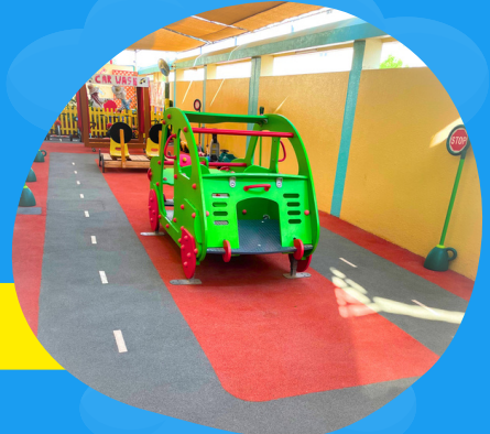
SHADED CYCLE TRACK AREA